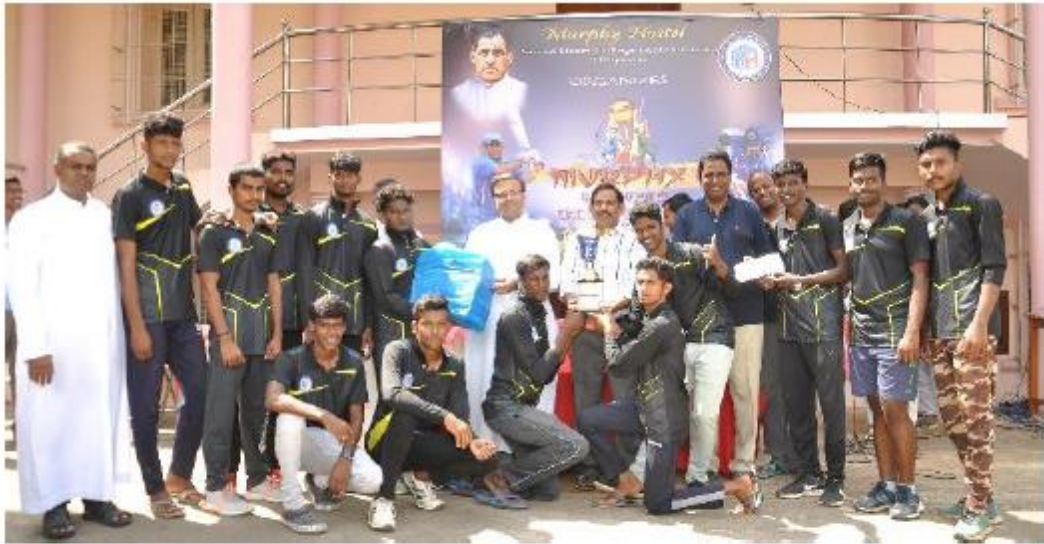
The Winners of the tournament