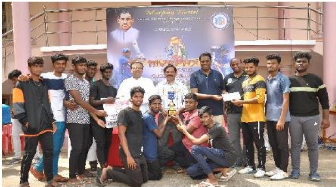
The Runners of the tournament