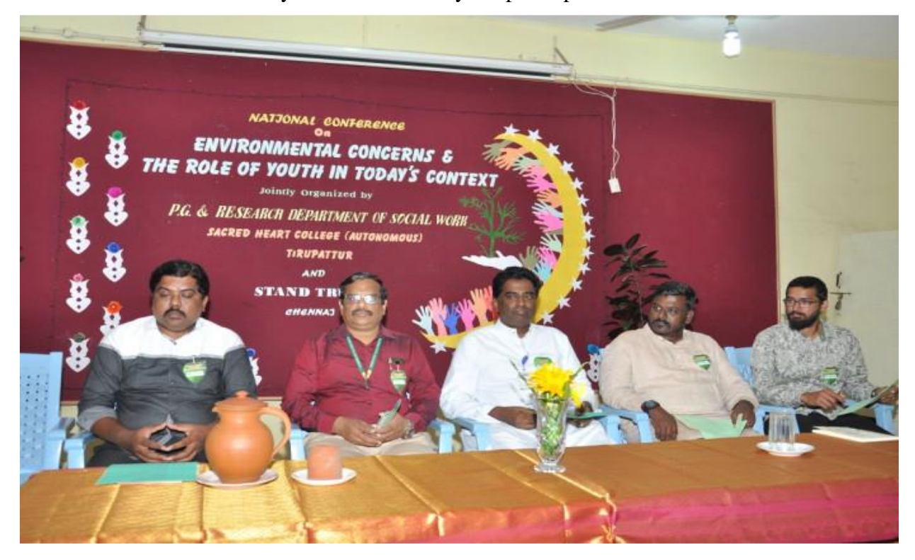
SHC Times V edition (22nd November 2018) Page 16

The PG and Research Department of Social Work organized a National Conference on "Environmental concerns and role of Youth in Today"s context" in collaboration with Stand Trust, Chennai on 11th September, 2018. The theme of the conference was to understand the Eco systems and Environment, discuss the environmental issues in today"s context, find the relationship between the economic development and environmental sustainability, analyze the role of industrialization over environmental degradation and enhance the role of youth in environmental sustainability. The resource persons of the conference SundarRajan, Director, PoovulaginNanbargal, were Mr. Dr. Maniyan, MagarishiGoshala&Panchakavia Research Center, Mr. SteffanAjay, World Wide Fund and Mr. S. Gnanaraj, Founder, The Ministro Foundation. The conference was convened by Dr. S. Paul Raj, Associate Professor & Head, P.G. & Research Department of Social Work, Sacred Heart College ,Tirupattur and Rev. Dr. S. Emmanuel SJ, STAND Trust & National Advisor for AICUF, Chennai. The conference recorded participation from 162 students and scholars in and around the state. The conference was felt necessary and resourceful by the participants.