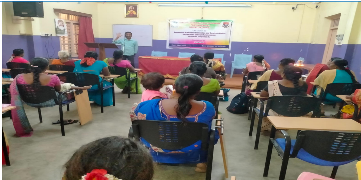
An orientation about Family counselling was given to the SHG leaders from different 15 village's during the sensitization programme organised by NABARD in Bosco Institute of social work Sacred Heart college Tirupattur, Tirupattur Dt. On 21.2.23