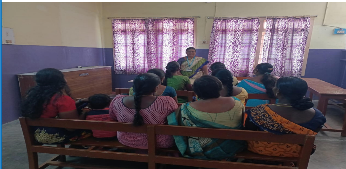
Awareness programme was organised for the shg members from kurusilapattu on stress management and happy family life. By Bosco Institute of social work sacred heart college Tirupattur. On 23. 2.23.