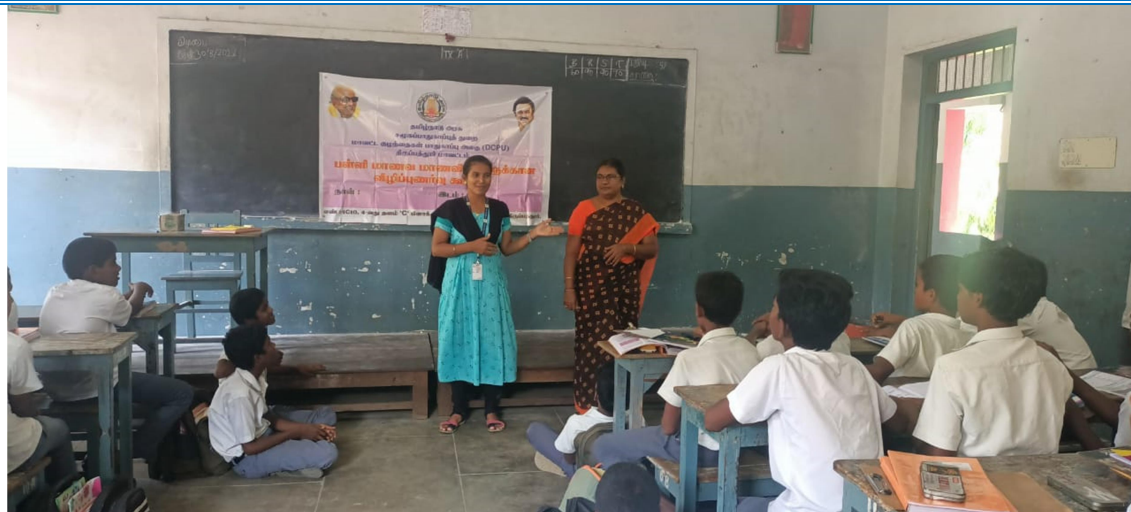
Jointly organized an awareness programme for school children with social defence held on 30.8.22.by FCC Bosco Institute of social work Sacred Heart college Tirupattur, Tirupattur Dt.