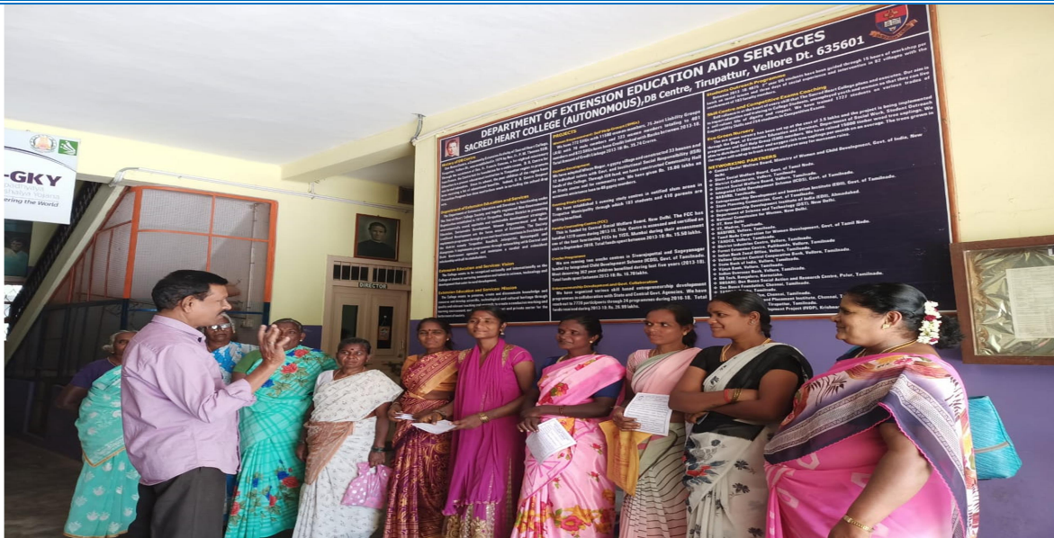
An awareness session conducted for the self help group members from thekupattu and kethandapatty villages on women issues and Alcoholic problem. Today at 11.30 am. By Fcc , Bosco Institute of social work, Tirupattur, Tirupattur District. on 13.02.2023