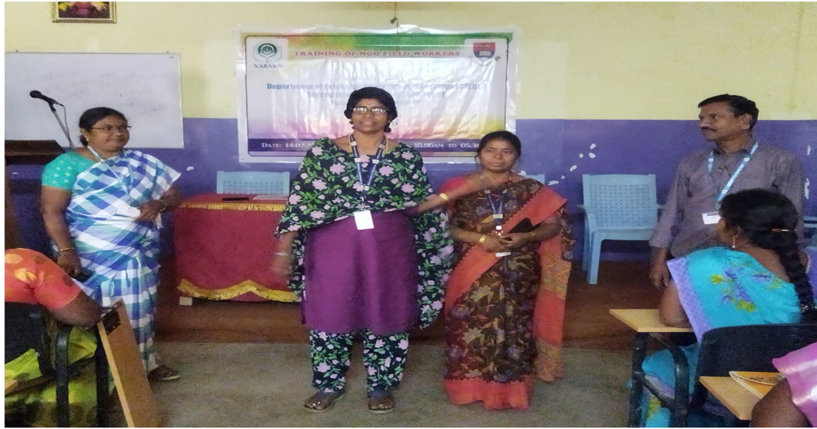
Had awareness program with OSC case workers in Sacred heart college Tirupattur. By FCC Tirupattur District. On 14.2.23.