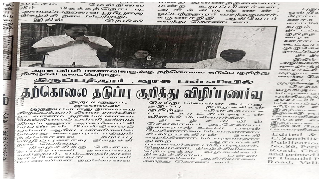
We were invited as a resource person to speak about suicide prevention for the Higher secondary school students in Madavalam and Meenatchi Girls school on 27th July 2022 organized by IIPA, Tirupattur. By FCC Bosco Institute of social work