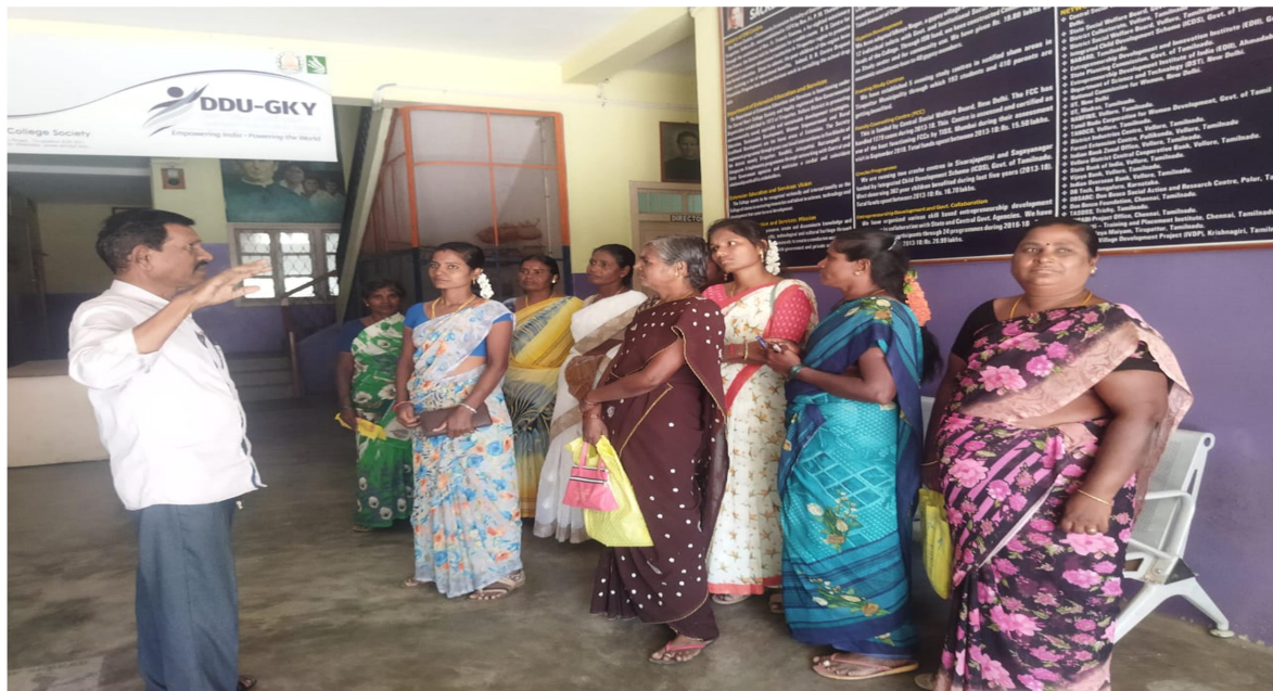
Had an awareness program for kannalampdatty SHG On Alcoholic issue s. By FCC Bosco Institute of social work sacred heart college, Tirupattur today. Tirupattur District. on 18.02.2023