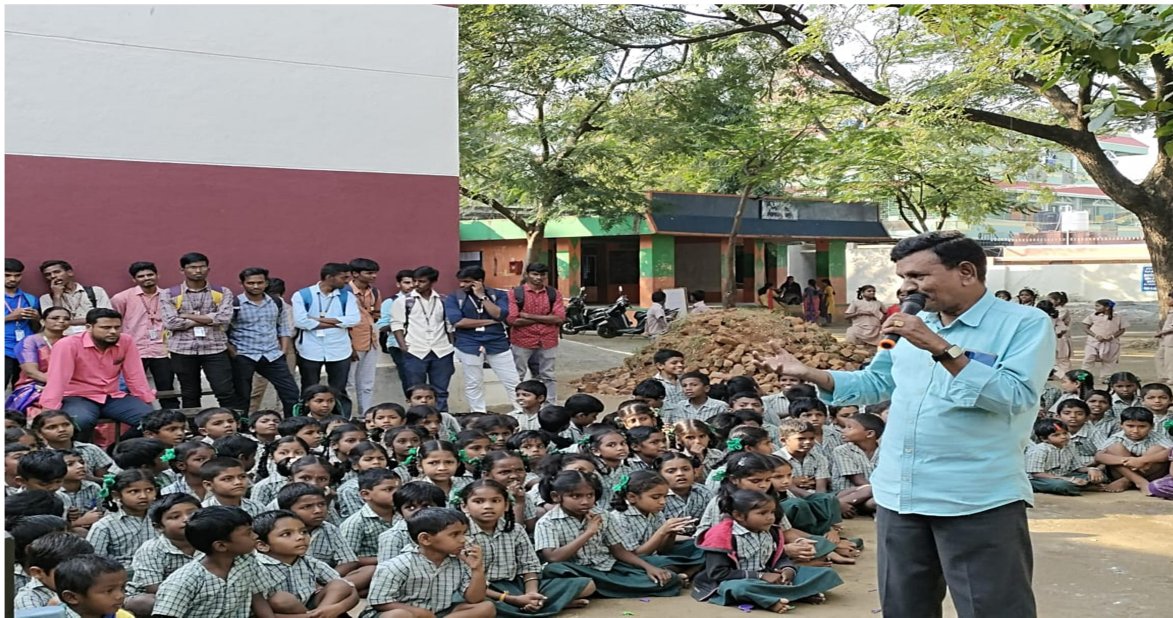
Motivation and awareness games were conducted for Ashok Nagar primary school children with the help of our college students. Children enjoyed very much. By Fcc Bosco Institute of Sacred Heart college Tirupattur. On 19.12.22.