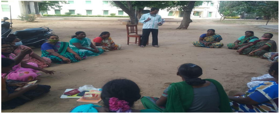
Awareness Programme on Women Issues - conducted for the Workers and Office Assistants of Mary Immaculate Convent in Tirupattur. - 31. 10. 2020