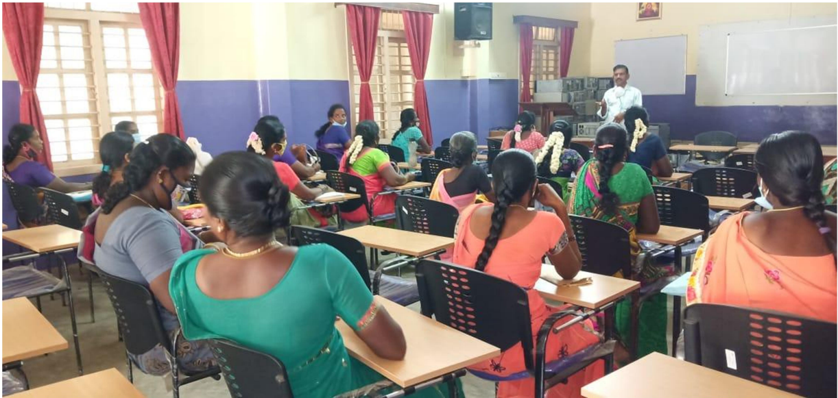
Awarness programme on COVID 19 and its implications held in the office premises for the leaders of WSHG's