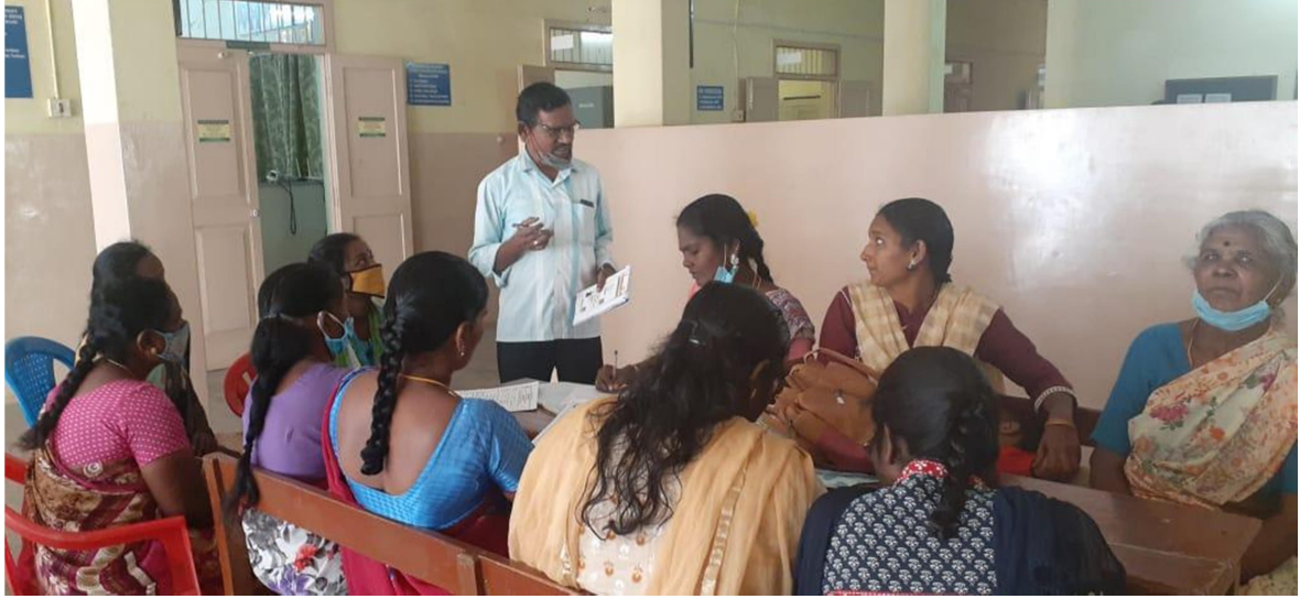
Orientation about FCC was given to the SHG members of Kethandapatti Village – Conducted in Bosco Institute of Social Work. 25.01.2021.