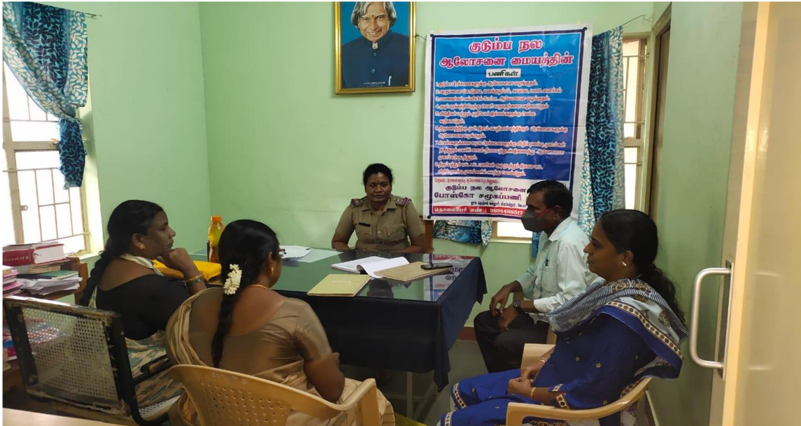
Sub Committee Meeting held on 29.09.2020