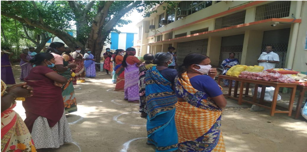
Special Medical camp on prevention of COVID 19 held in Pachal 05.09.20