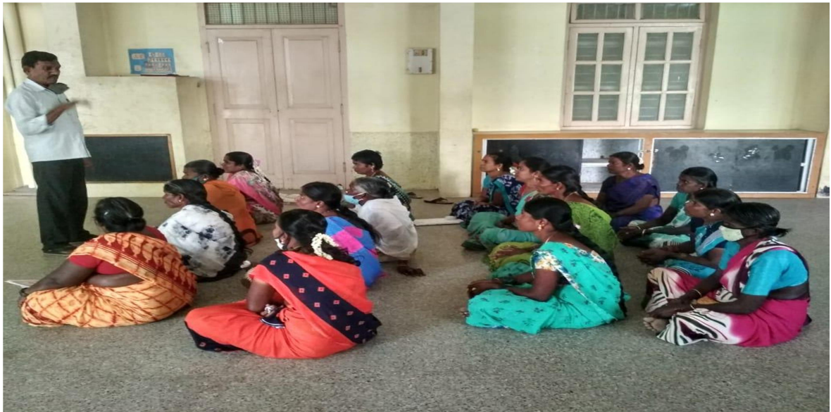
Orientation about Women Education and Prevention of Child Marriage programme was conducted in the Bosco Institute of Social Work for the people of Kathari & Natrampalli. – 20.01.2021