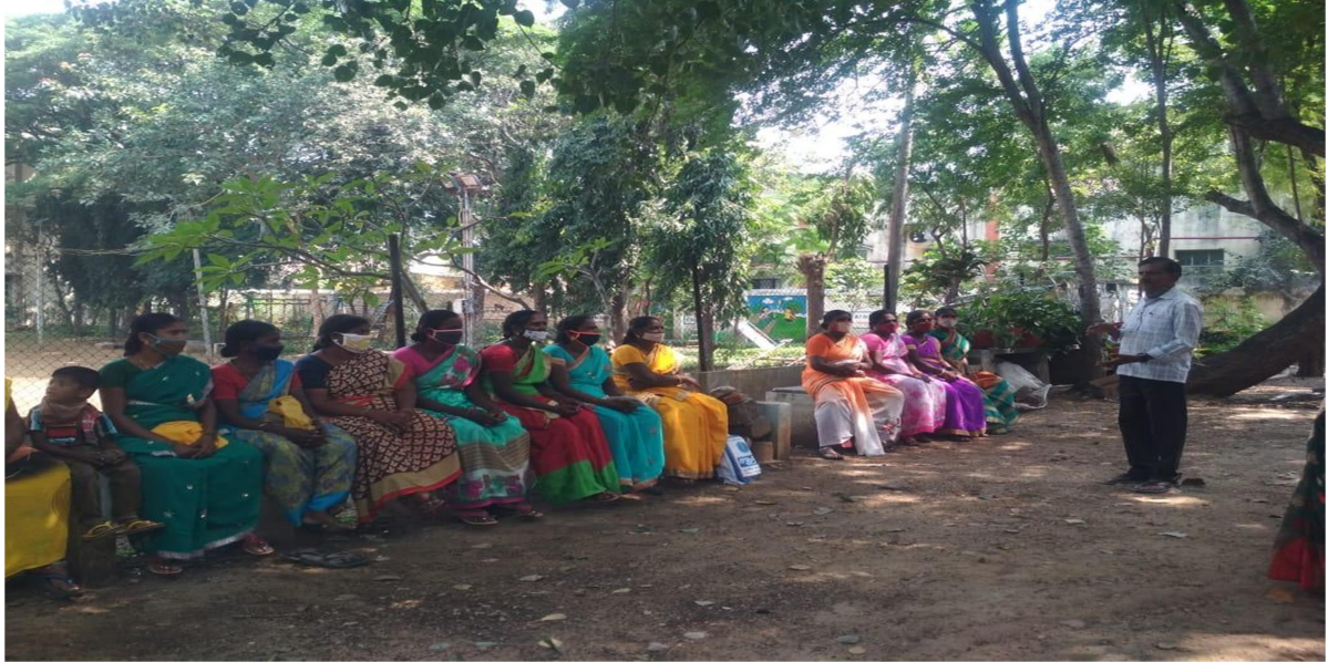
Awareness Programme on Alcoholic problems were conducted for the people of Kurisilapattu & Kudapattu. – 08.11.2020