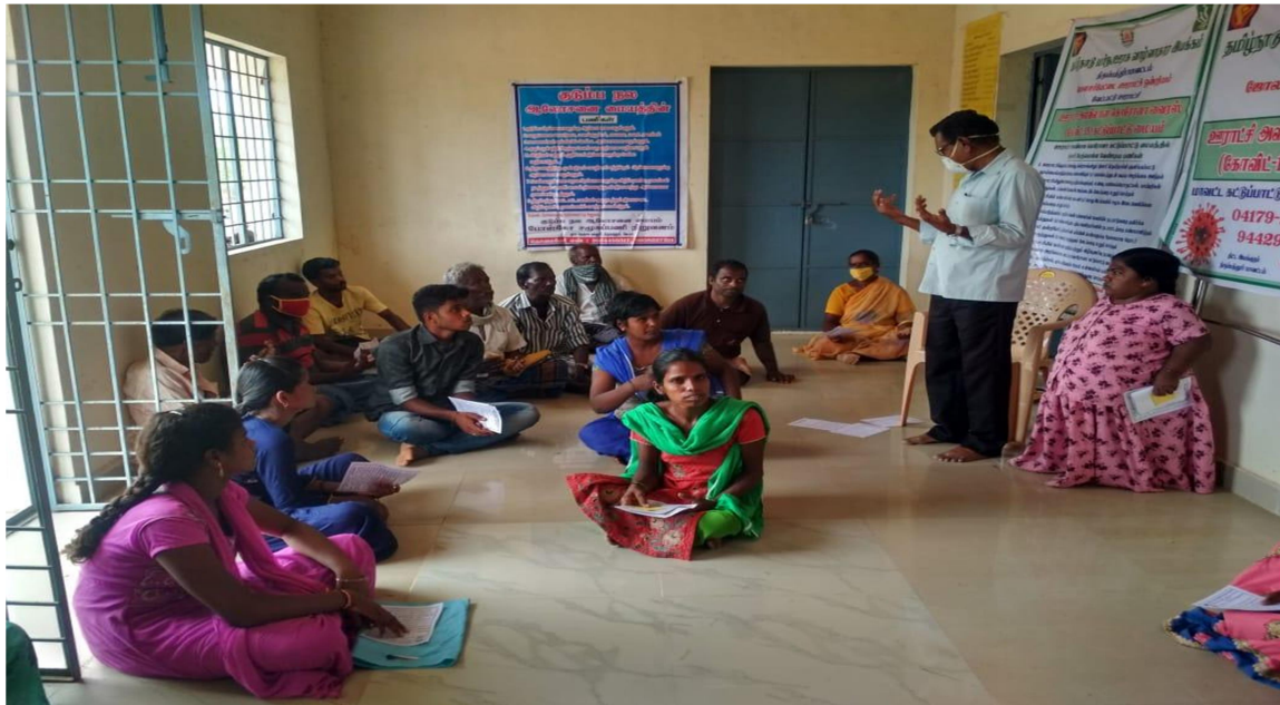
Awareness Programme on COVID19 held in vettapattu Panchayat