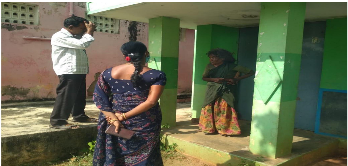
A mentally sick person was identified and rehabilitated to karunai illam Vaniyambadi. 15.12.2020