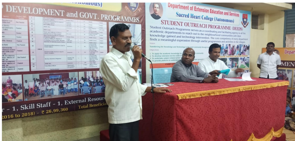
Helped to clean and rearrange the Town library in the Sacred Heart College Students, Tirupattur.