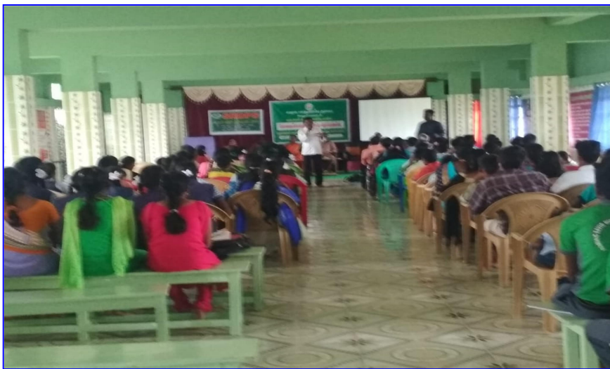
02.12.2019: Awareness Programme on Alcohol and Tobacco Prevention