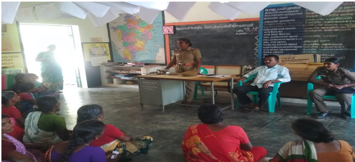
Wareness Camp with Inspector of AWPS held in Somalapuram - Focused On Women Issue