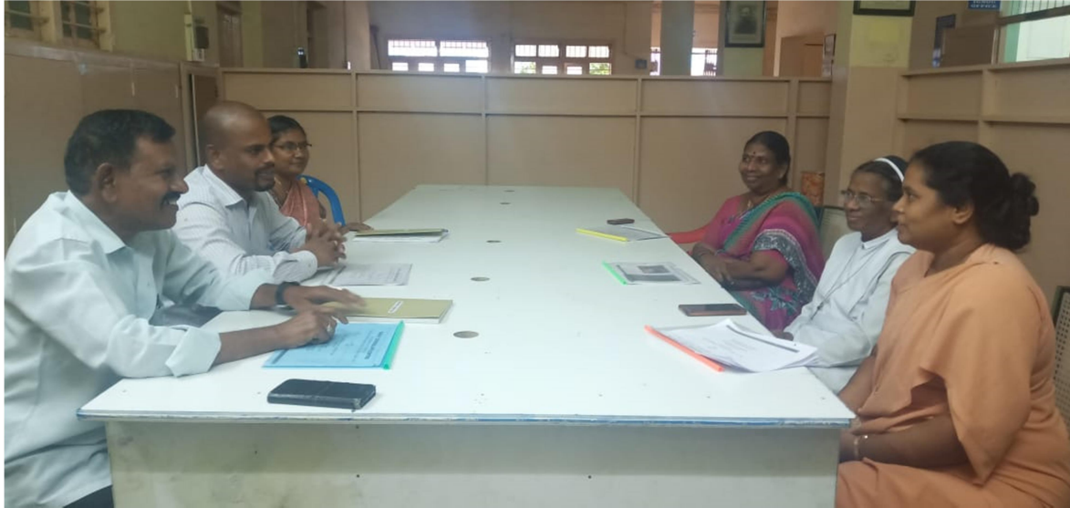
The Sub-Committee Meeting Held on 13 th September 2019 at Bosco Institute of Social Work.