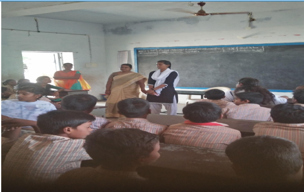
Auxilium ITI , Tirupattur.