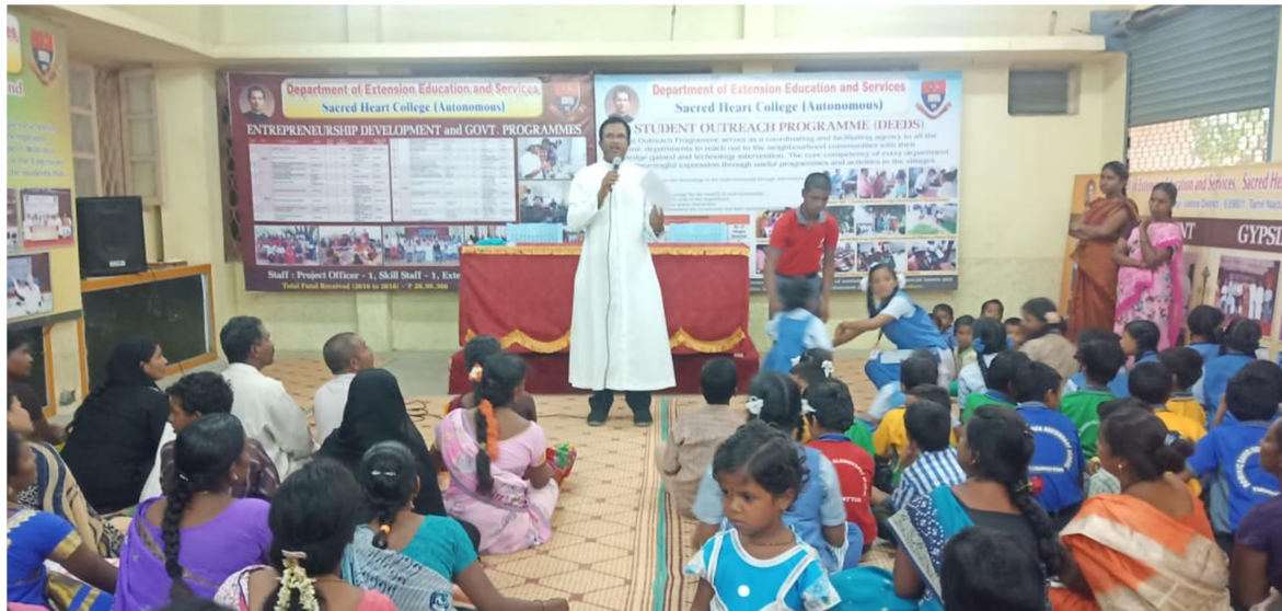
The Director Addressing the public about Family Counseling Center activities and its Importance