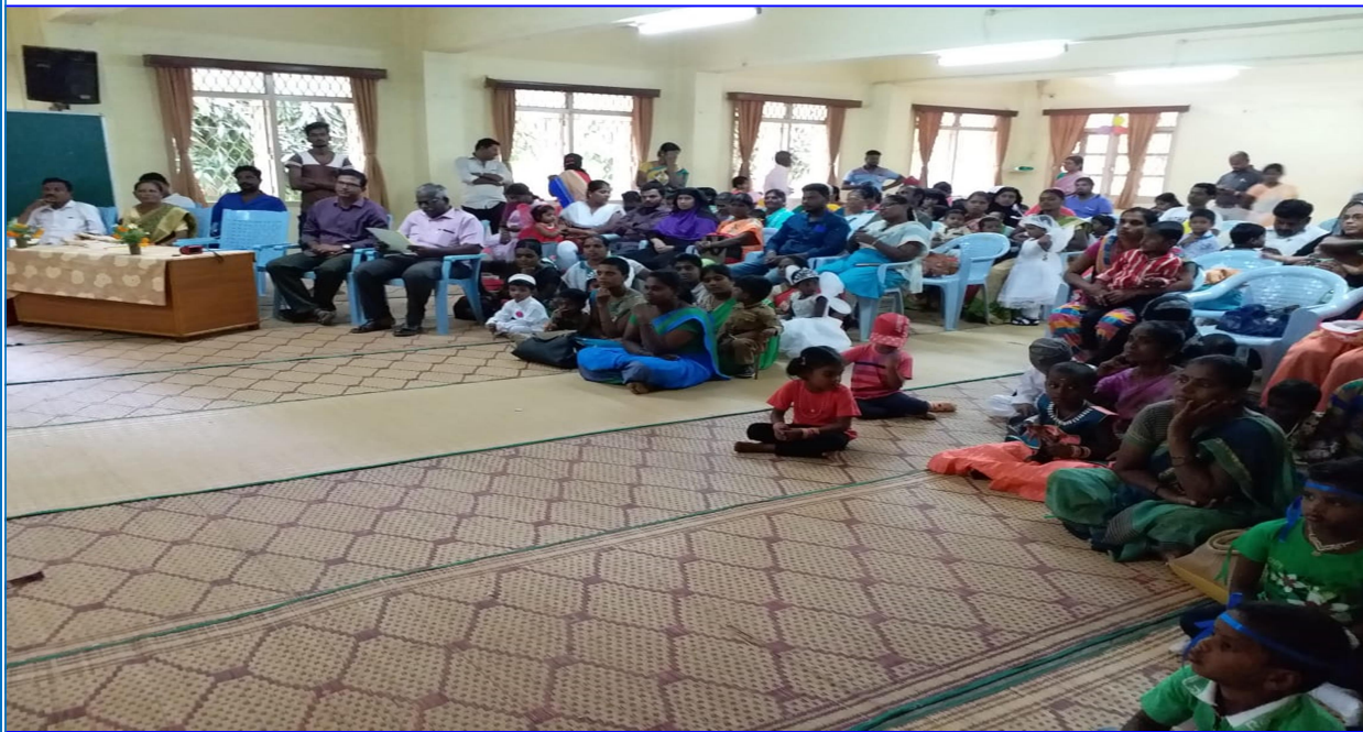
14.11.2019 Children Day Celebration with Parents