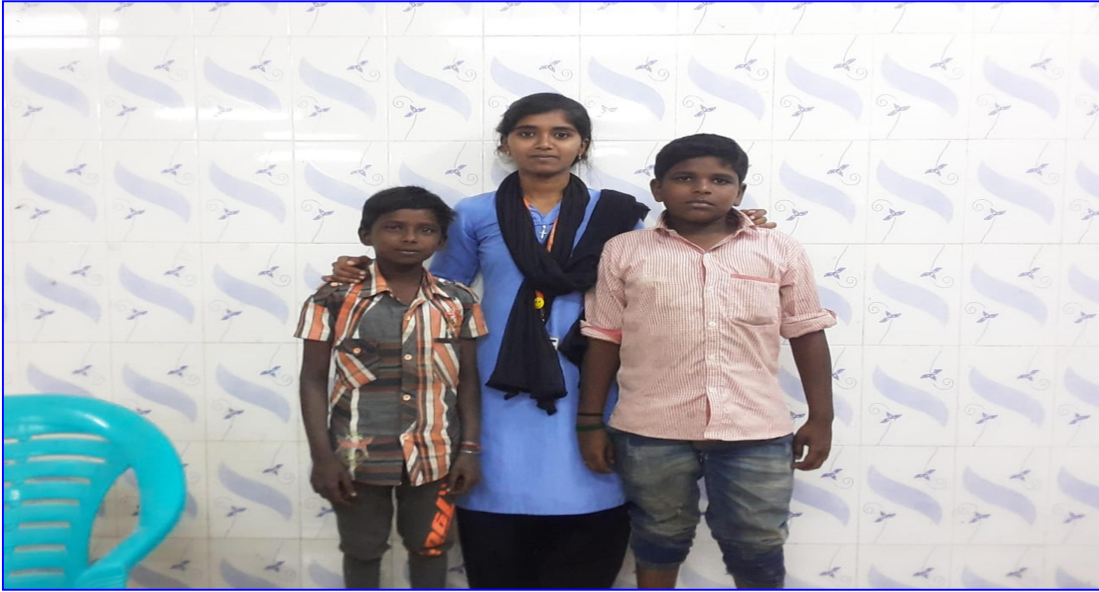
Identified Drop Children from Slum Area: Bosco Nagar, Tirupattur Municipality