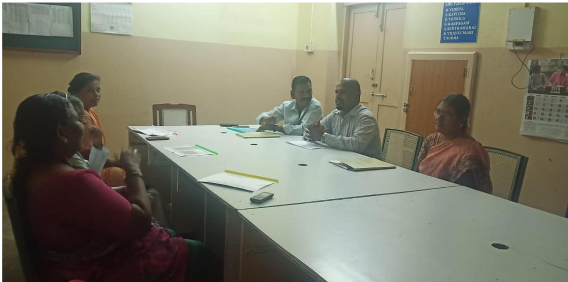
Awareness Camp on Good touch and Bad touch.(Govt. Hr. School, Kasinayakanpatti)