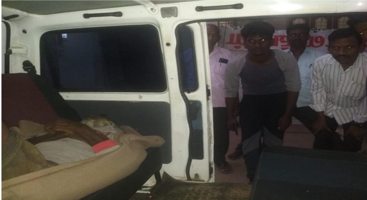
Rehabilitation an unknown person with the help of MSW Students, Tirupattur.