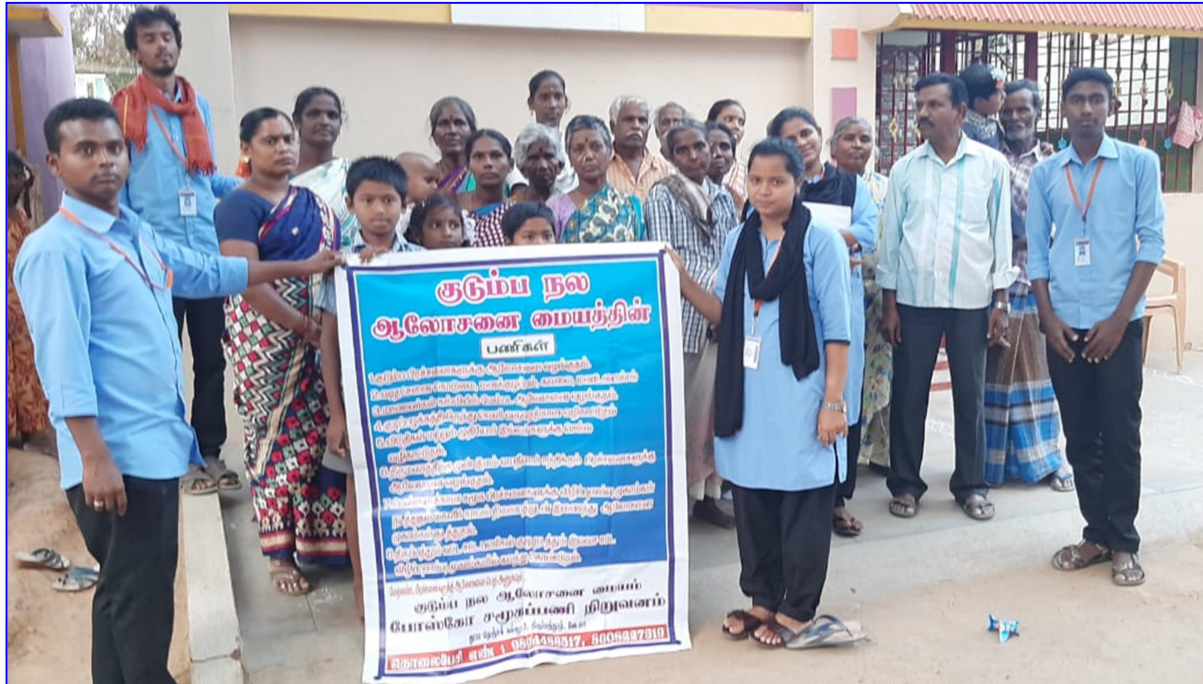
27.02.2020: Awareness Programme on Prevention of Child Marriage held at Kasinayakanpatti