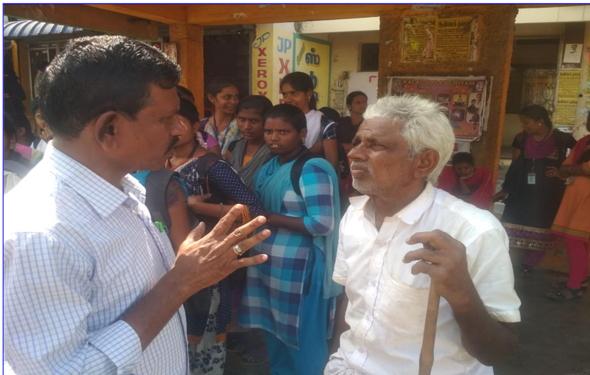
13.01.2020 Camp for the Differently Abled Persons