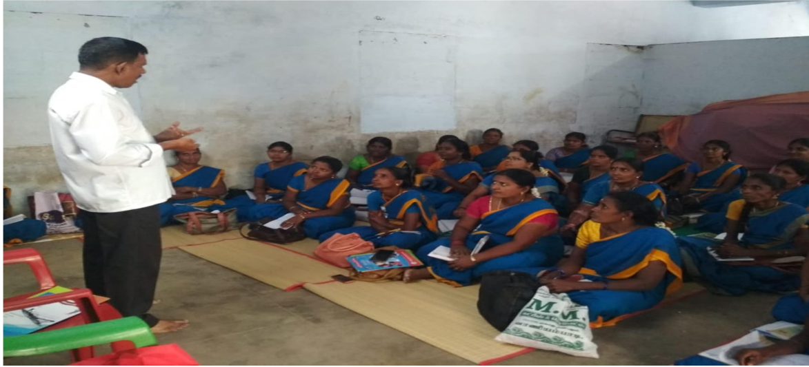
Orientation about FCC programme was given for the Aanganwadi workers of Natrampalli, and Kandhili Block.