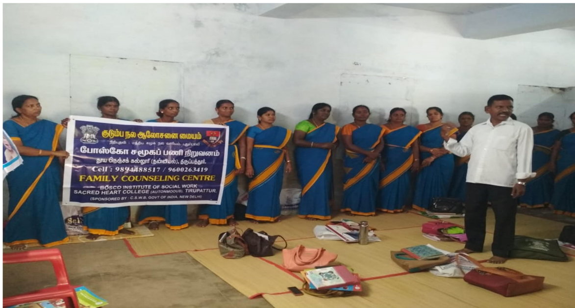
Awareness Camp with Free Legal Aid with the Pannel Advocate Kakanampalayam - Village