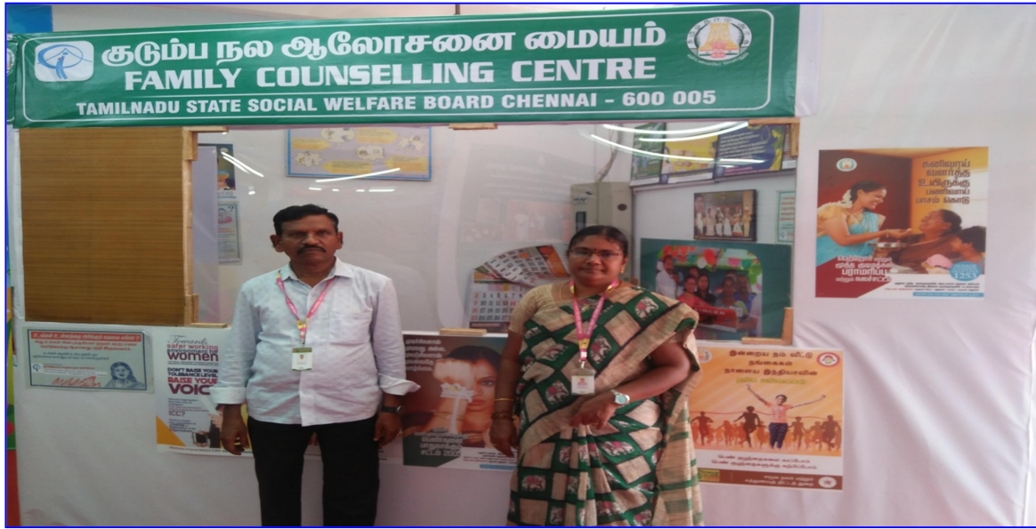
05.01.2020: FCC Counselors participated in the Trade Fare held at Chennai