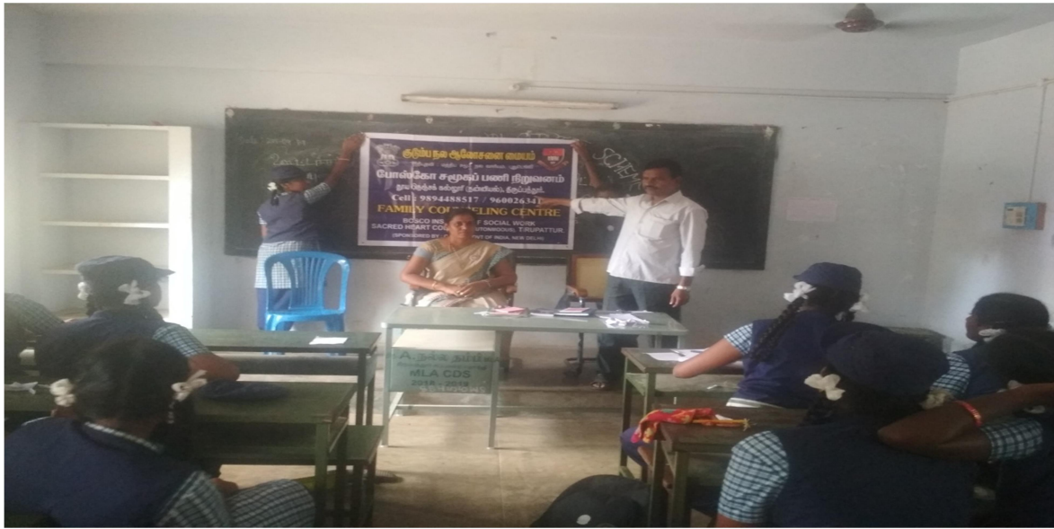
Pre-Marital Counseling for NSS Camp – Meenatchi Girls Hr School Students, Tirupattur