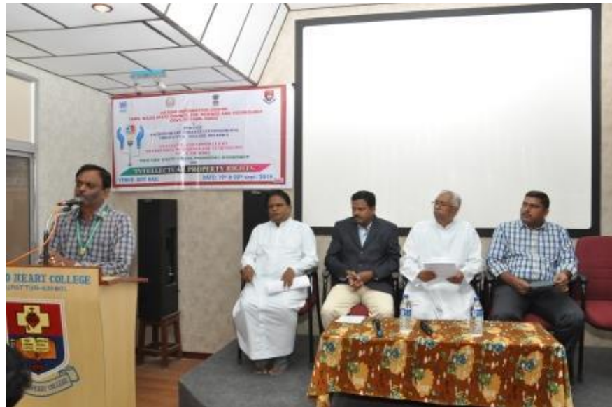
Photo taken during the Inaugural session of the program