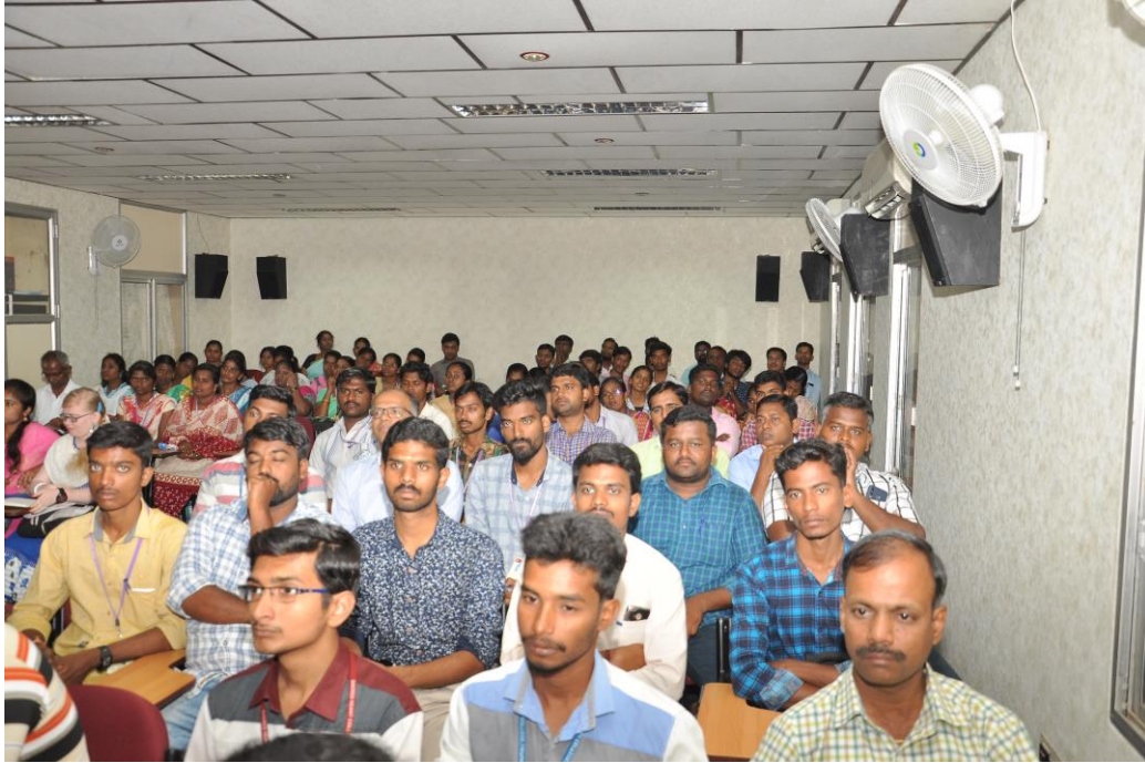
Participants during the conference