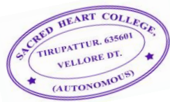
Principal Sacred Heart College (Autonomous) Tirupattur-635 601, Tirupattur - Dist