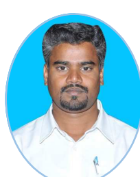
Mr. J Antony Amalraj Documentation Center